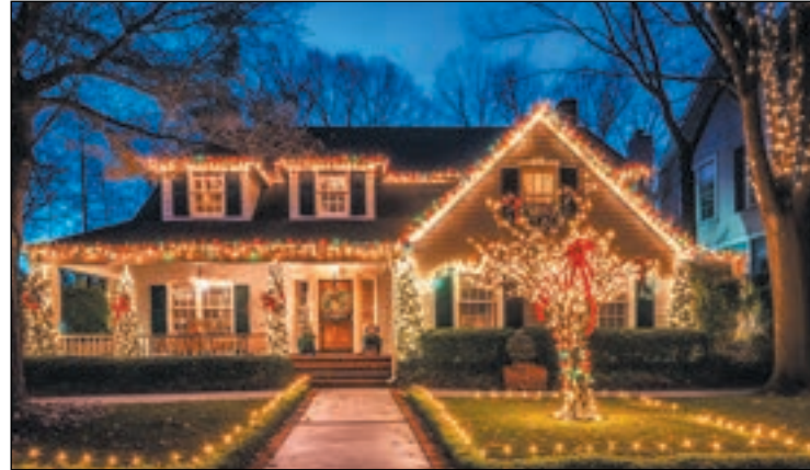
Consider entering the fun and festive 2024 Scripps Ranch News–Berkshire Hathaway Home Lighting Contest.

Four categories of awards will be included this year: Norman Rockwell Award,