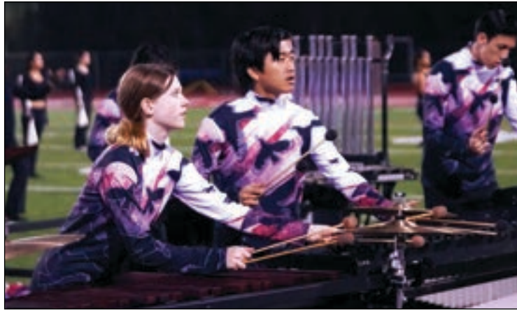
Members of the Falcon Corps and Color Guard percussion section perform during halftime of a Scripps Ranch High football game.

“We were in a smaller division last year, but we still