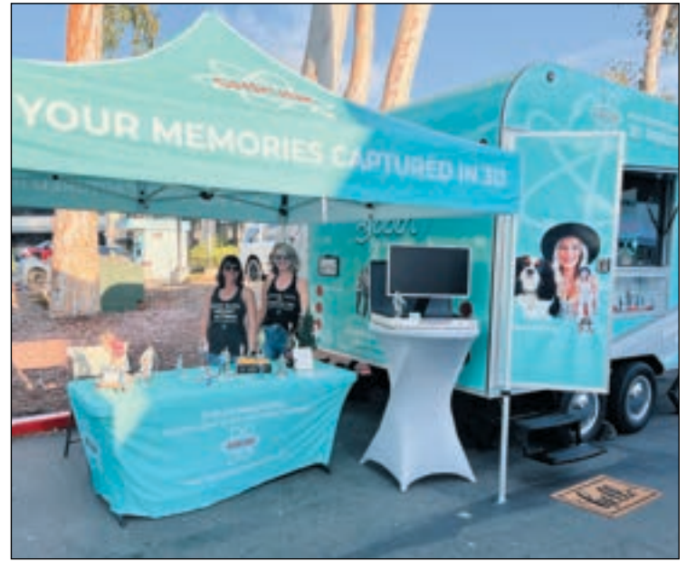
Shrunken 3D San Diego is a mobile 3D scanning trailer equipped with LED lights, 95 cameras and four projectors.

at the Scripps Ranch Farmers Market, held 3:30-7:30 p.m. each Thursday at 10045 Carroll Canyon Road.