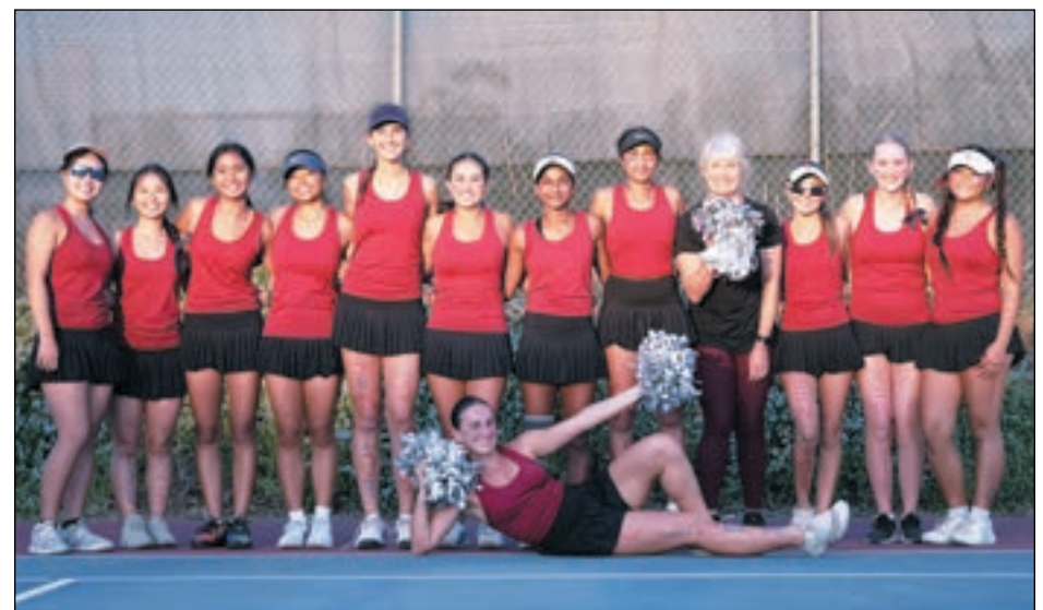
ALL THE WAY TO FINALS: The SRHS women's varsity tennis team made it to the CIF San Diego Section Division 1 Championship Finals before suffering a defeat to La Jolla Country Day on Nov. 2. To get to the finals, the team defeated San Marcos High, Vincent Memorial Catholic and Academy of Our Lady of Peace.