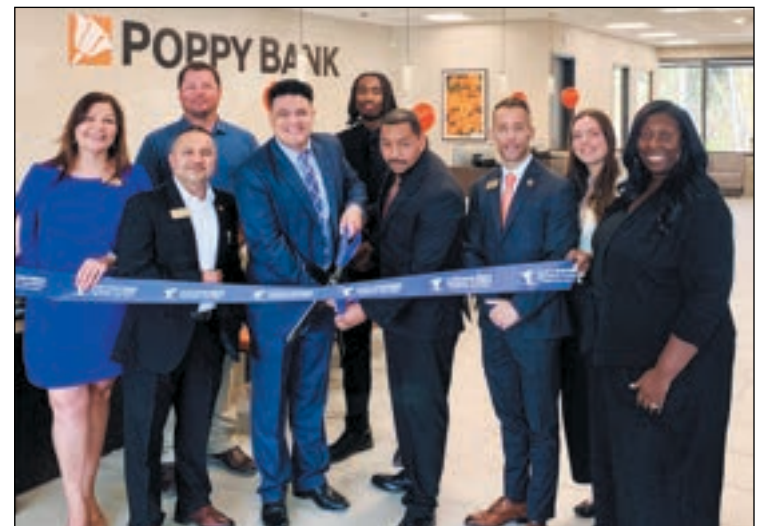
POPPY BANK OPENS: Officials from Poppy Bank celebrate the official grand opening of its Scripps Ranch location on Oct. 25. The full-service banking facility is located at 10000 Scripps Ranch Blvd., Unit 102.