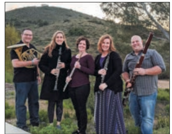
The Left Coast Quintet will perform live Dec. 15 in the Community Room of the Scripps Miramar Ranch Library.

Masks are recommended although not required. Scripps Miramar Ranch Library