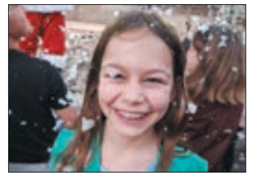
A happy Girl Scout enjoys the artificial snow at a previous tree lighting event.

Donate a new, unwrapped toy to the Toys for Tots toy drive for children. The mission of the U.S. Marine Corps Toys for Tots Program is to collect the toys and distribute them as holiday gifts to less fortunate children in the community. Any Scout who