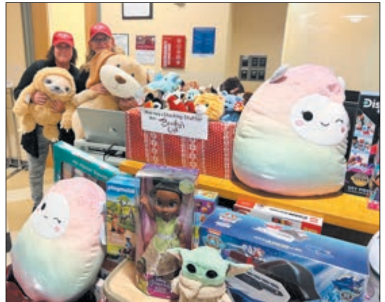
Becky's Gift volunteers deliver presents to Moores Cancer Center in San Diego so that patients undergoing treatment won't have to worry about buying gifts for the youngsters in their life.

Those who have not yet donated or would like to help out even more may still participate as Becky's Gift is still accepting new and unwrapped toys.