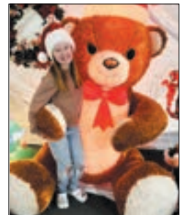
A child poses with a giant teddy bear at a past holiday event at the Scripps Ranch Farmer's Market.

The Scripps Ranch Farmer's Market and Family Festival is held each Thursday from 3:30 to 7:30 p.m. at 10045 Carroll Canyon Road.