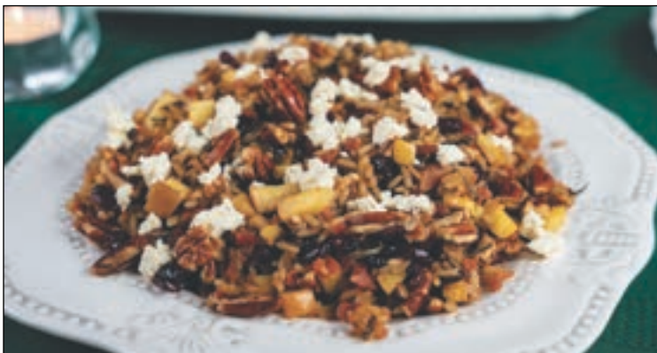
Herbed Wild Rice and Apples offer mouthwatering flavors to make your holiday meal truly memorable.

Note: Recipe can be doubled for large crowds.