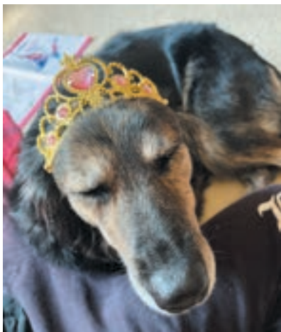
The Holders doggo, Miss Bella, likes to wear her princess crown for Halloween and hoped to make the paper.

Festive trick-or-treaters and Halloween enthusiasts (including one pet) wore a variety of creative and colorful costumes as they celebrated the fun holiday in Scripps Ranch this season. Thanks go out to all Scripps Ranch News readers who sent in these fun photos!