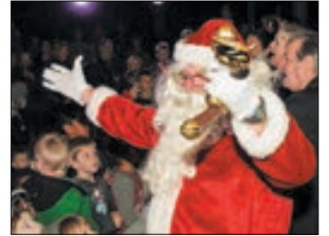
The arrival of Santa at the annual Holiday Concert is a Scripps Ranch tradition.