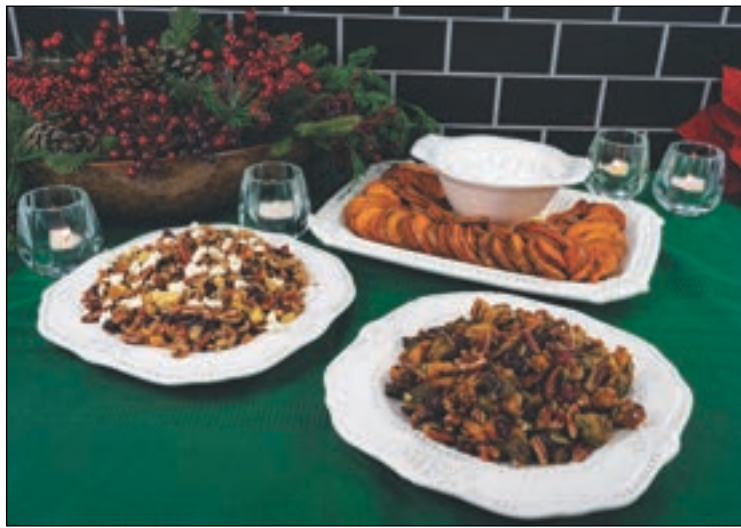
Try these comforting side dishes to round out your holiday meals. (Family Features)

In bowl, mix oil, melted butter, garlic powder and