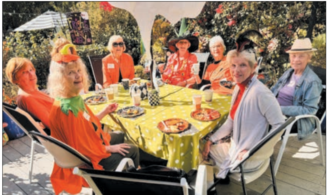
Welcome Club members joined ghosts and goblins to celebrate Halloween at their monthly coffee.

A shopper examines fashions available at one location in the annual Scripps Ranch Community Garage Sale, sponsored by San Diego Castles, and held across Scripps Ranch by participating homeowners on Oct. 12.