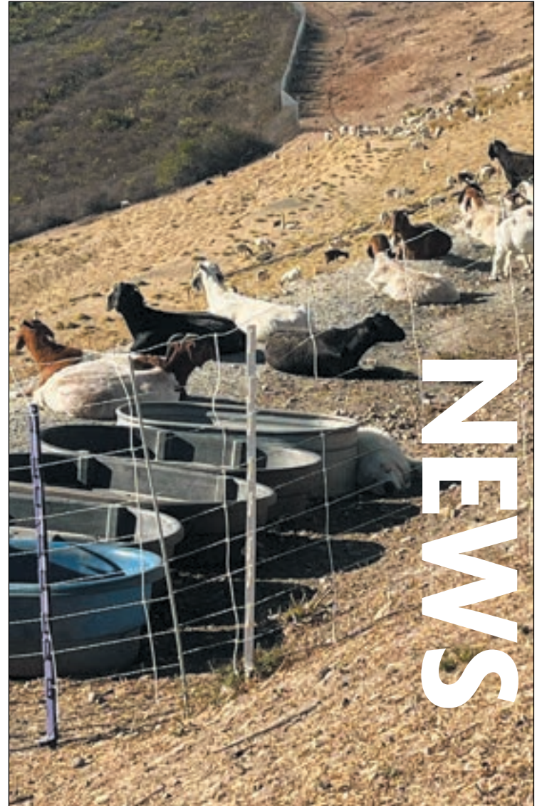
These goats were assigned the mission of devouring the brush on the slope.