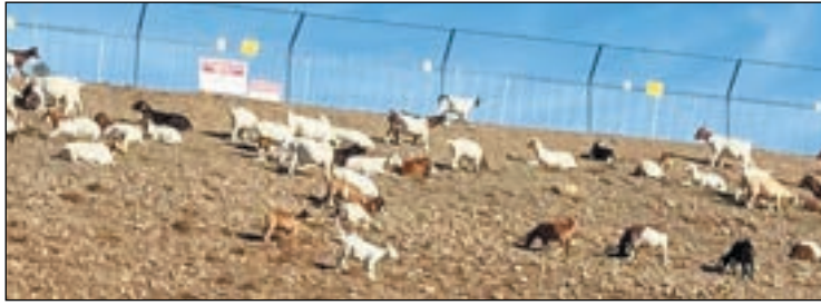
A herd of about 250 goats graze near Miramar Reservoir along the downstream face of the western part of the dam.

Scripps Ranch Fire Safe Council, (858) 201-3771, srfiresafecouncil@gmail.com, www.srfiresafe.org