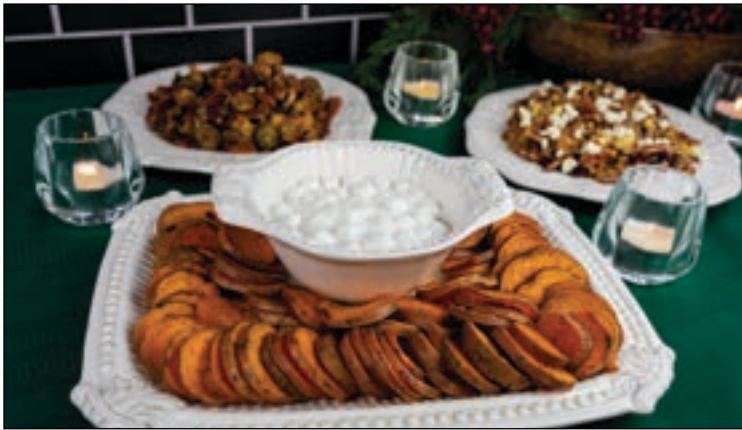
Roasted Sweet Potatoes with Marshmallow Sauce can give your gathering a special seasonal spin.