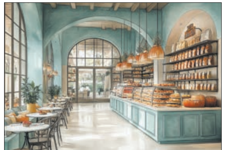
This rendering illustrates the interior vision for Buon Cibo Italian Specialties. (courtesy artwork)