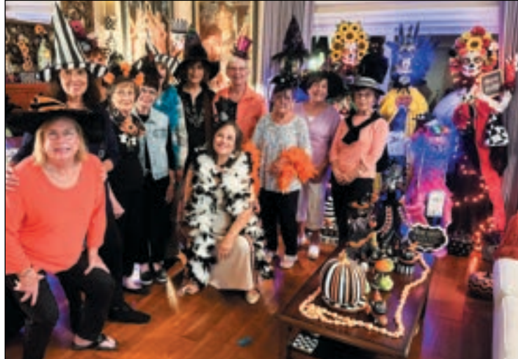
Several costumed members of the Scripps Ranch Women's Club partake in the club's Halloween Bunco gathering.

G houls, goblins and witches, oh, my! From costumes to candy, Halloween was a fun and spooktacular time for the Women's Club. Several of our interest groups including Bunco, Bridge, Fun and Games, and Arts and Culture embraced the Halloween theme at their October events with lots of smiles, creativity and themed food and decor.