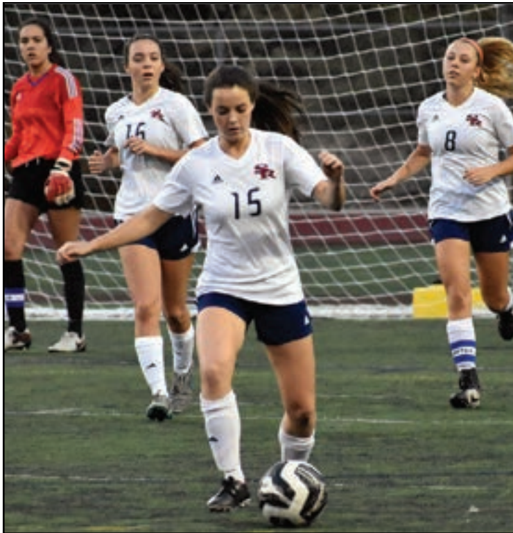
Scripps Ranch High girl's soccer players control the ball in Nov. 28 action against West Hills High.

The Lady Falcons employ about three main systems, and they adjust depending on their opponent, according to Pernicano.