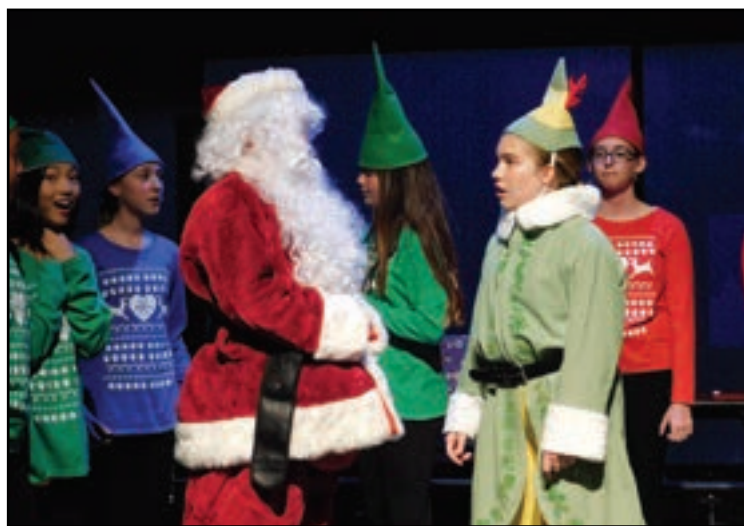
Mustang Theatre students utilize up to 32 wireless microphones.