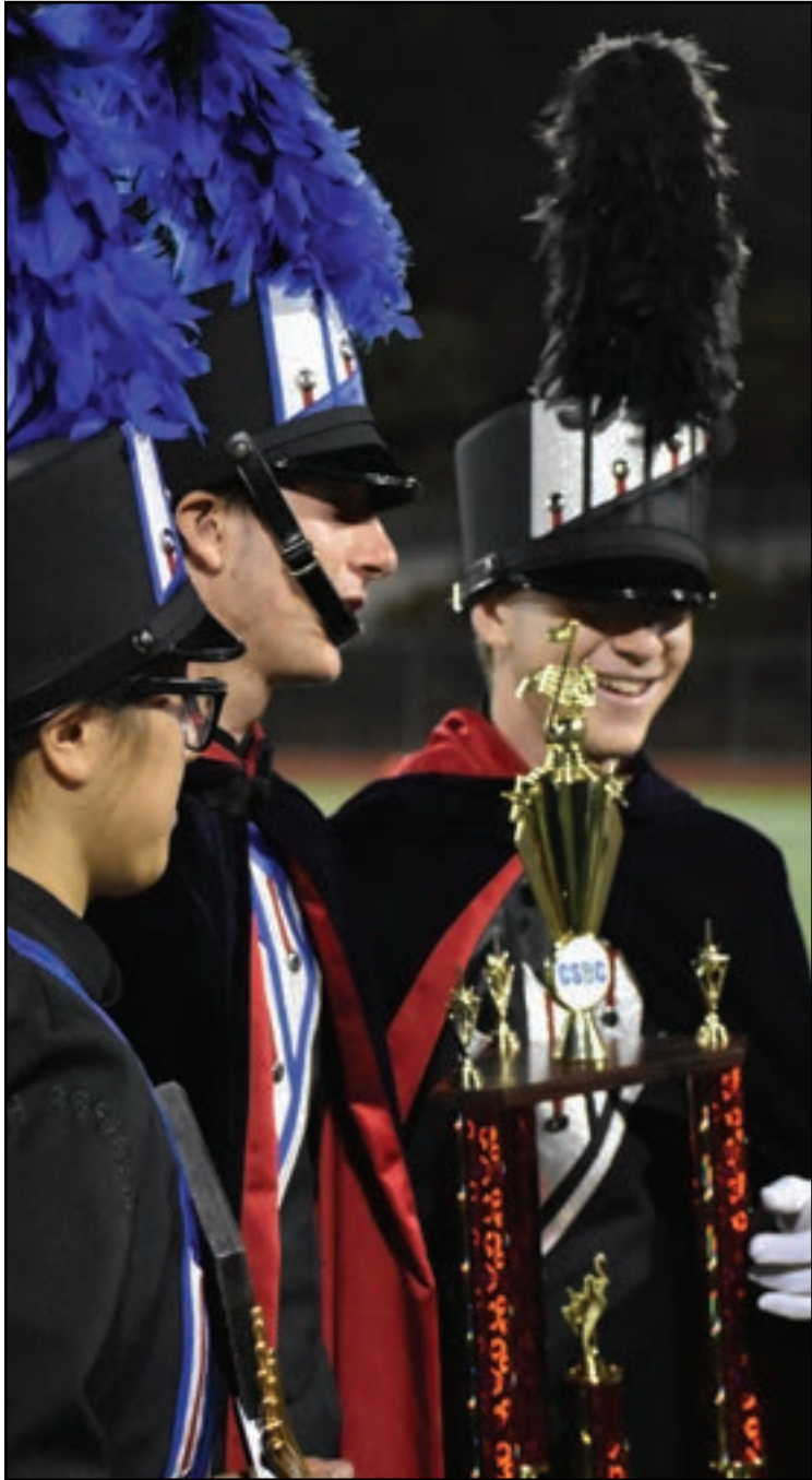
Leaders of the Scripps Ranch High School Marching Band display trophies earned during an earlier competition.

The Scripps Ranch High School (SRHS) Marching Band had an incredibly successful season of competitions this fall, and its showing on Nov. 18 at the California State Band Championships (CSBC) in Huntington Beach was equally impressive. In fact, it was fantastic.