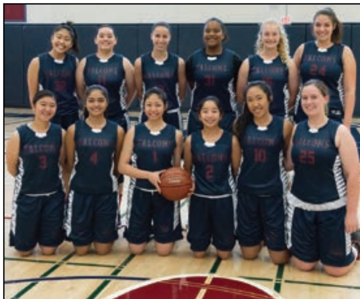
The Scripps Ranch High School women's varsity basketball team is loaded with talent as it enters the 2017-18 season.