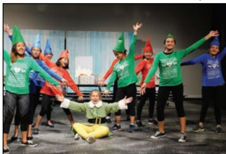
Student actors perform in the recent production of “Elf the Musical, Jr.”

duction is a two-act comedy called “Mutually Assured Destruction, 10 Plays about Brothers and Sisters.” Set to run Jan. 23-26, 2018, it consists of 10 individual connected scenes. The technical theater class will build 10 small living room sets.