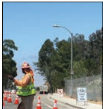
Flag men direct traffic on Scripps Lake Drive near the intersection of Red Cedar Drive.