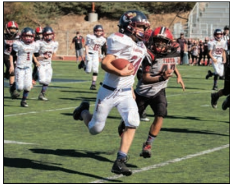
A runner for the Jr. Pee Wee Falcons breaks loose against the Vista Panthers during the D3 Championship game.

See the full story in the Sports & Fitness section of ScrippsRanchNews.com.