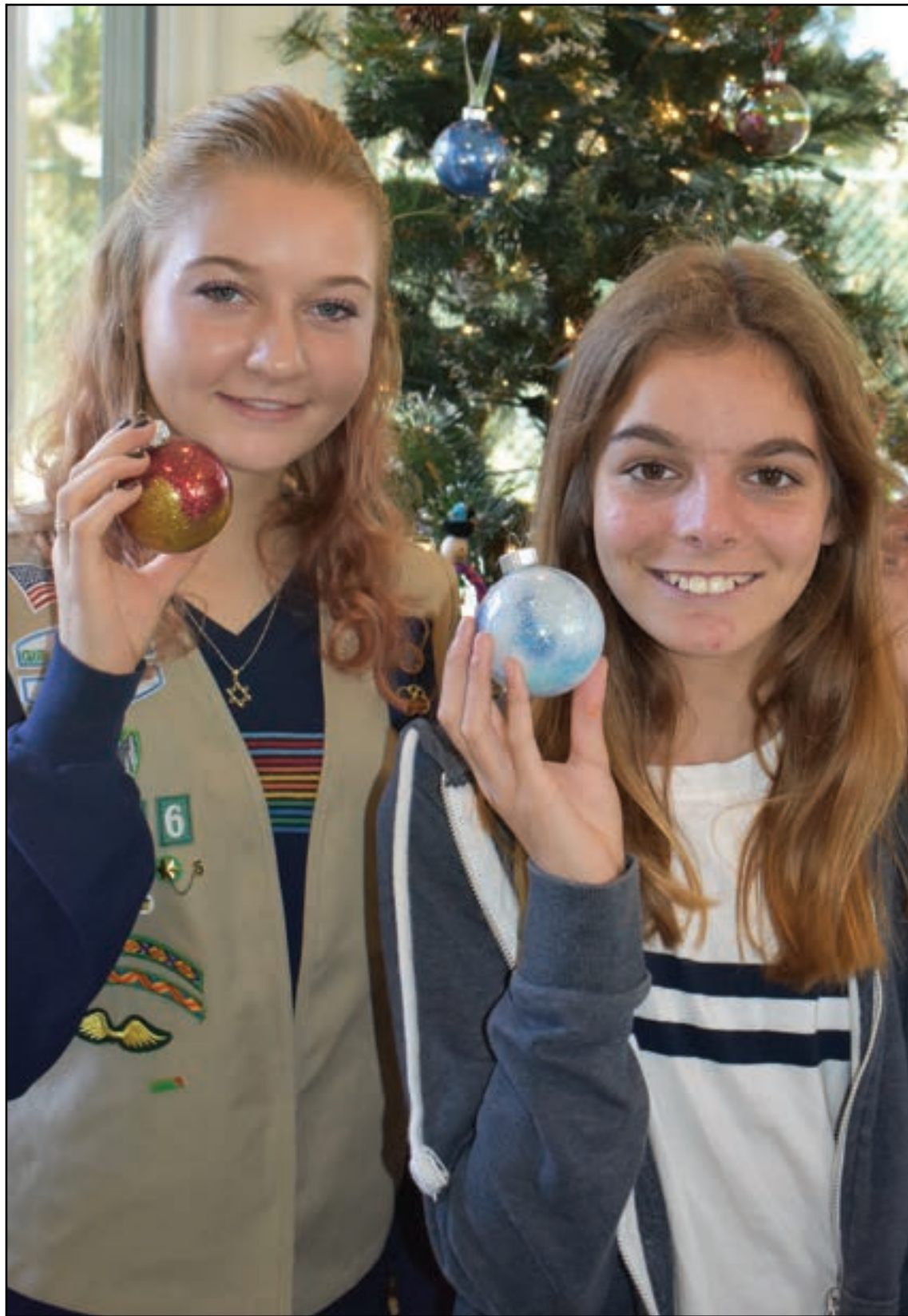
Girl Scouts created holiday ornaments to be delivered this week to families that were victims of the recent wildfires in the Santa Rosa area.